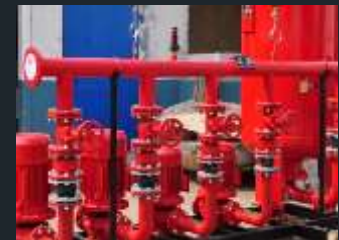
Supply and install the fire protection equipment