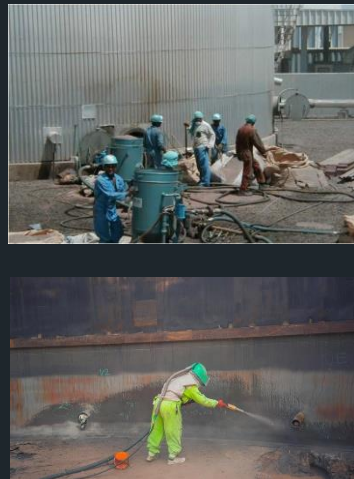
Tank Cleaning Service and maintenance