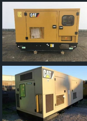
Supplying electricity generators