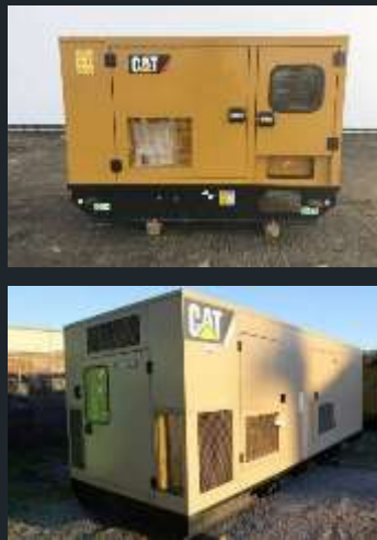
Supplying electricity generators