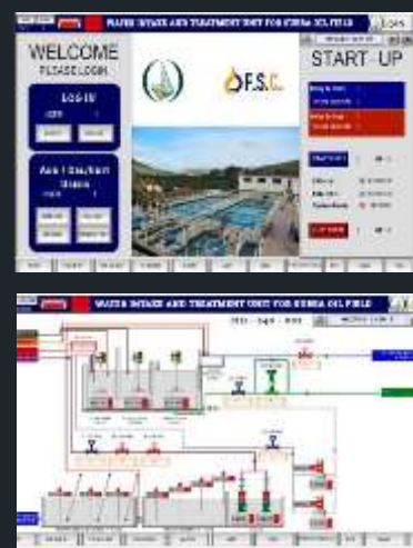
Programming and design of the PLC- logic program and HMI