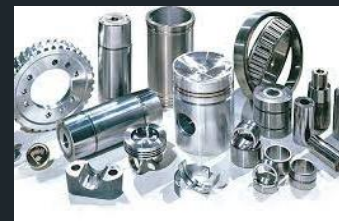
Supply the spare parts and tires for vehicles