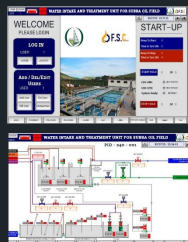
Programming and design of the PLC- logic program and HMI