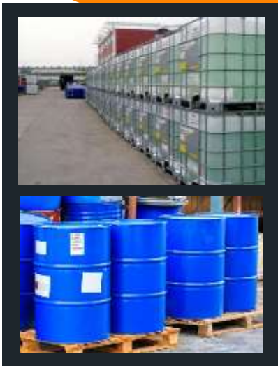
Supplied Chemical Materials