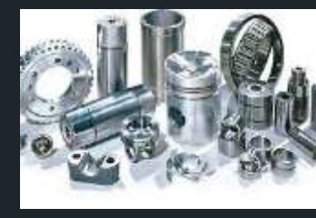
Supply the spare parts and tires for vehicles