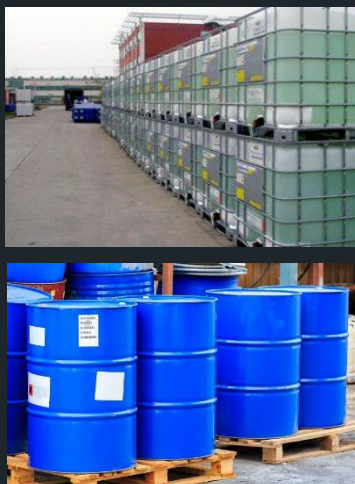
Supplied Chemical Materials