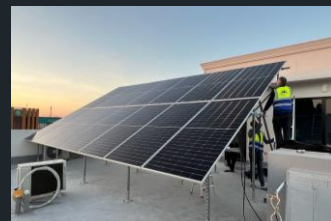
Supply and installation the solar Systems