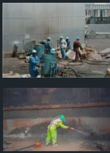
Tank Cleaning Service and maintenance