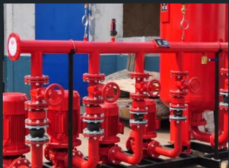
Supply and install the fire protection equipment