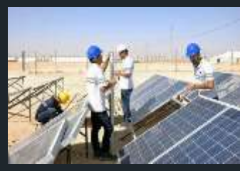
Supply and installation the solar Systems